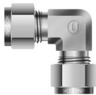
Union Elbow UEU