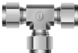
Union Tee UUT