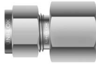
Female Connector UFC