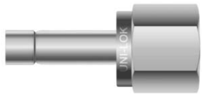
Female Adapter UFA