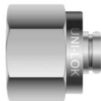
Tube Plug UP