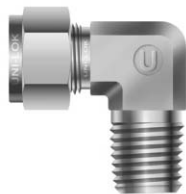
Male Elbow UME

Male NPT Threads are available for all metric UMC. Add "N" as a suffix instead of "R".